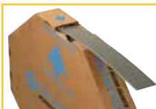
BladePro Doctor Blades