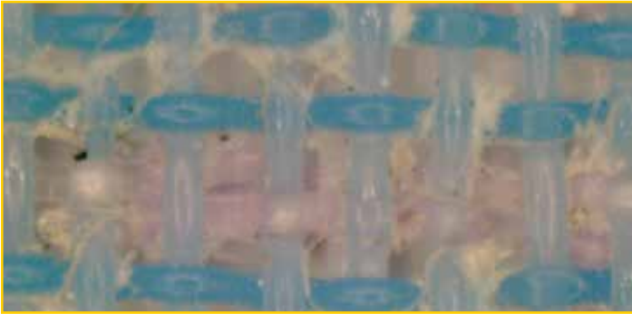
HP Oscillating Shower