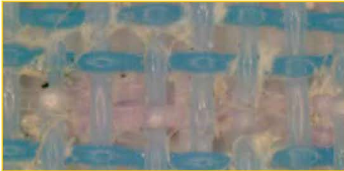
HP Oscillating Shower