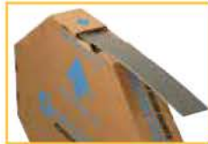
BladePro Doctor Blades