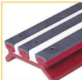
Felt Conditioning Units