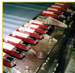
VersaFoil® Forming Elements

Wilbanks Ceramics, Exclusively from COLDWATER.