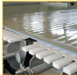
Low Vacuum Units