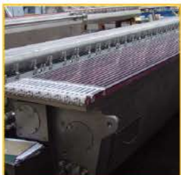
High Vacuum Units