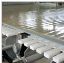
Low Vacuum Units