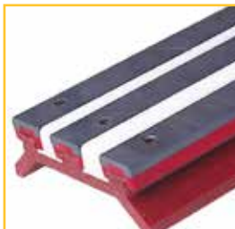
Felt Conditioning Units