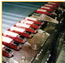
VersaFoil® Forming Elements

Wilbanks Ceramics, Exclusively from COLDWATER.