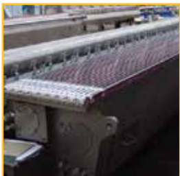
High Vacuum Units