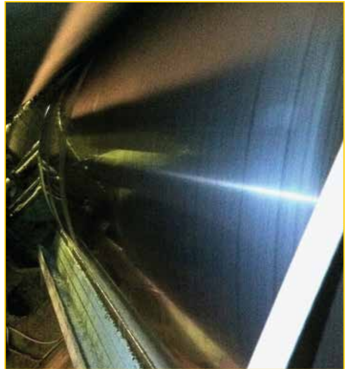
Dryer Can with PolyClean Applicator System

Dirty dryer cylinders and fabrics can create health and safety hazards such as dust explosions, fires and injuries from manual cleaning; sheet quality issues due to holes in the sheet, dirt in the sheet, poor moisture profiles and printability issues; production issues due to breaks, waste, shutdowns and reduced drying efficiency; converting issues due to breaks, deposits and waste.