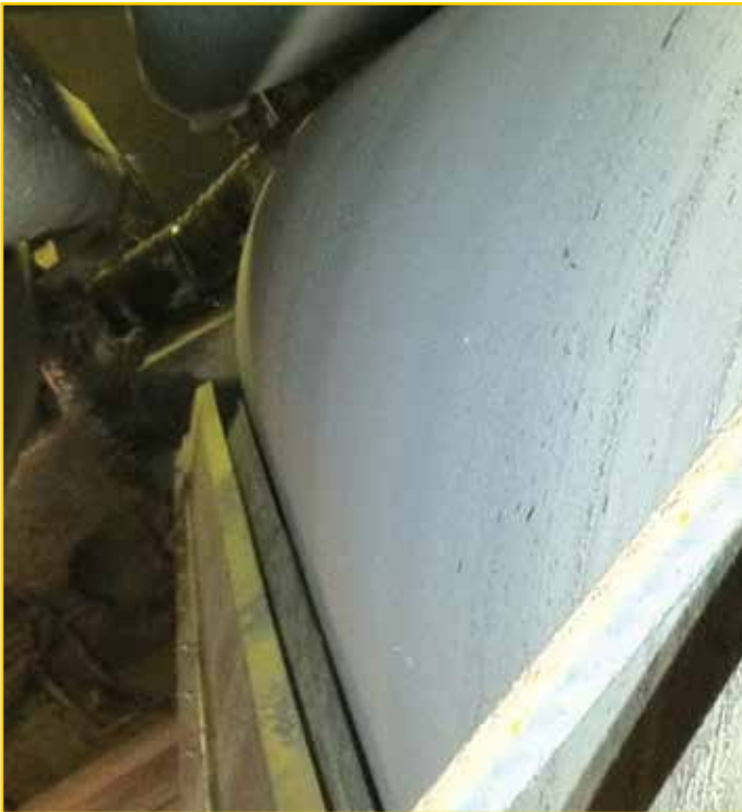
Dryer Can without PolyClean Applicator System

Papermakers are constantly challenged with a variety of deposits and impurities in the dryer section that include stickies, fiber dust and starch/coating particles. As these impurities build up on the drying cylinders and dryer fabric they create a multitude of problems that affect safety, quality and profitability.