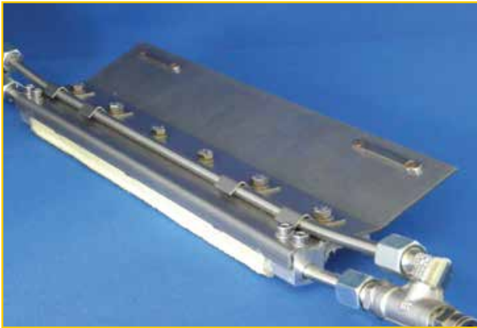
PCA System with Wick Applicator - Top View

The PolyClean Applicator System easily attaches to an existing blade holder and includes an application wick for continuous and uniform metering of our PolyClean passivation agent to both the dryer cylinder and the dryer fabric. The VOC-free PolyClean complies with the FDA for paper and paperboard in contact with aqueous and fatty foods.