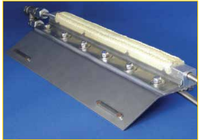
PCA System with Wick Applicator - Bottom View