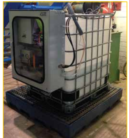
The PCA Dosing Unit is Provided at No Charge