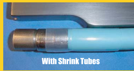
With Shrink Tubes