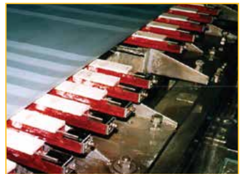
VersaFoil® Forming Elements