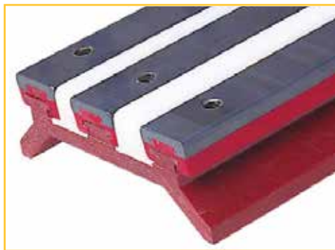
Felt Conditioning Units