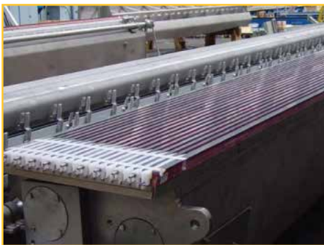
High Vacuum Units