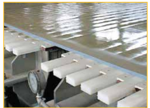
Low Vacuum Units