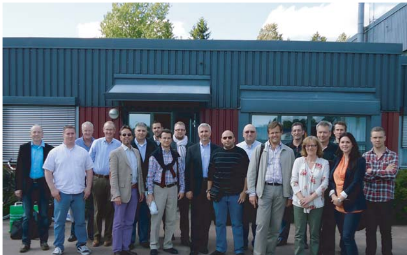
A plant tour and luncheon in Kil