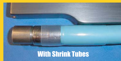
With Shrink Tubes