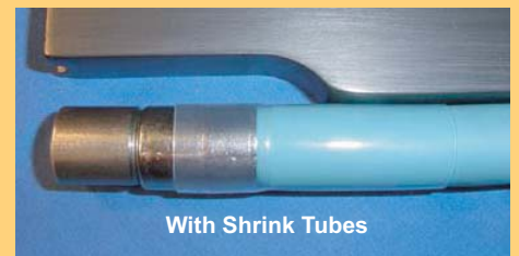
With Shrink Tubes

Excessive load tube pressure will cause over expansion of the tube in the relief notches of the seal. This is a common condition for tube failure. Coldwater Shrink tubes eliminate this problem.