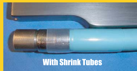
With Shrink Tubes